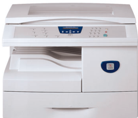
WorkCentre M15 with platen cover

The Xerox name is synonymous with quality, innovation and service. And it means day-in, day-out reliability. The WorkCentre M15 is extremely durable, designed and built to perform flawlessly in today's high-speed, high-pressure workgroup settings.